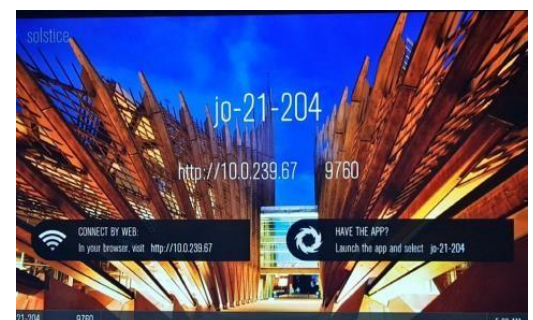
Solstice on the projected screen