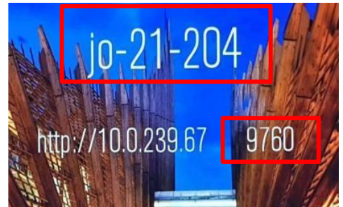
Example Solstice room and key code

Input the 4-digit key code from the destination monitor. You will now see the content that is on your own device displayed on the monitor.